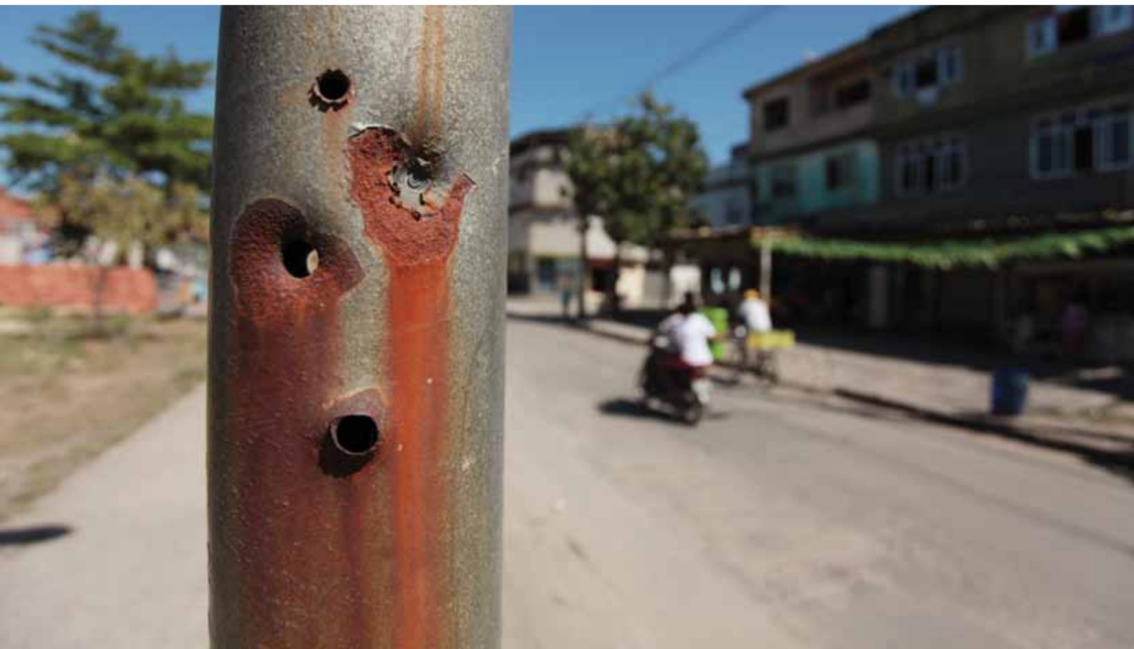
Rio de Janeiro, Brazil, 2010.