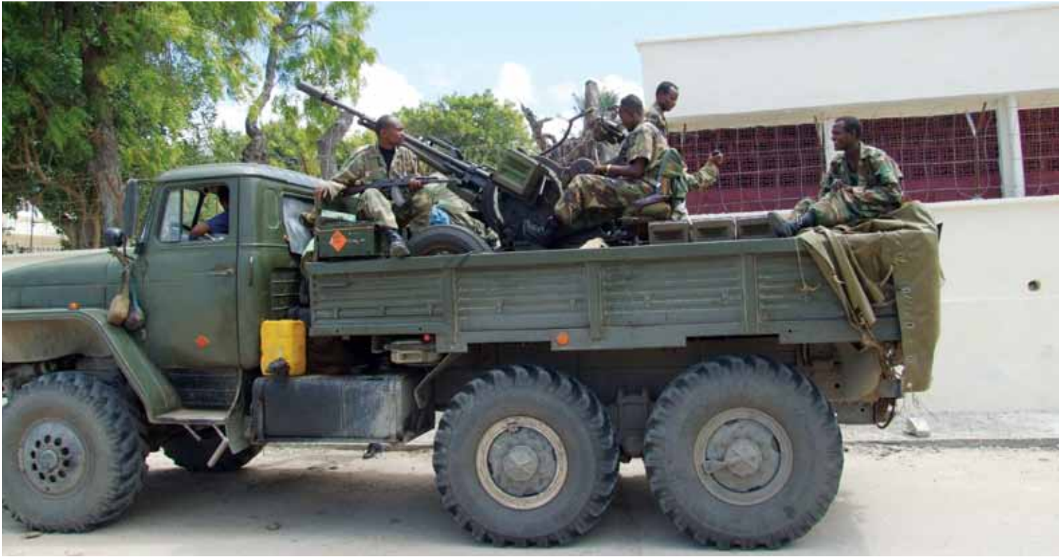
Some states have proposed an Arms Trade Treaty should be limited to the seven categories of the UN Register of Conventional Arms and small arms and light weapons. Yet apart from the rifle carried by one of the soldiers, none of the arms, ammunition and military equipment in this picture would fall within this limited proposed scope for an ATT.

the inclusion of small arms ammunition on the grounds that it will “complicate consensus.” 42 This can be read as a signal that Russia, and possibly other sceptics, want to maintain the UN register focus, that including SALW is a compromise that might be reached, but that including ammunition could be a step too far. Whether this is a derailing tactic or a legitimate viewpoint can of course be up for debate. Other sceptical states such as Egypt have argued in similar ways about restricting the scope of an ATT in order to preserve “universality.” 43 Regarding Egypt, they have become increasingly vocal against the inclusion of small arms and light weapons in the scope of an ATT, a position that will also by extension exclude small arms ammunition. Additionally, states