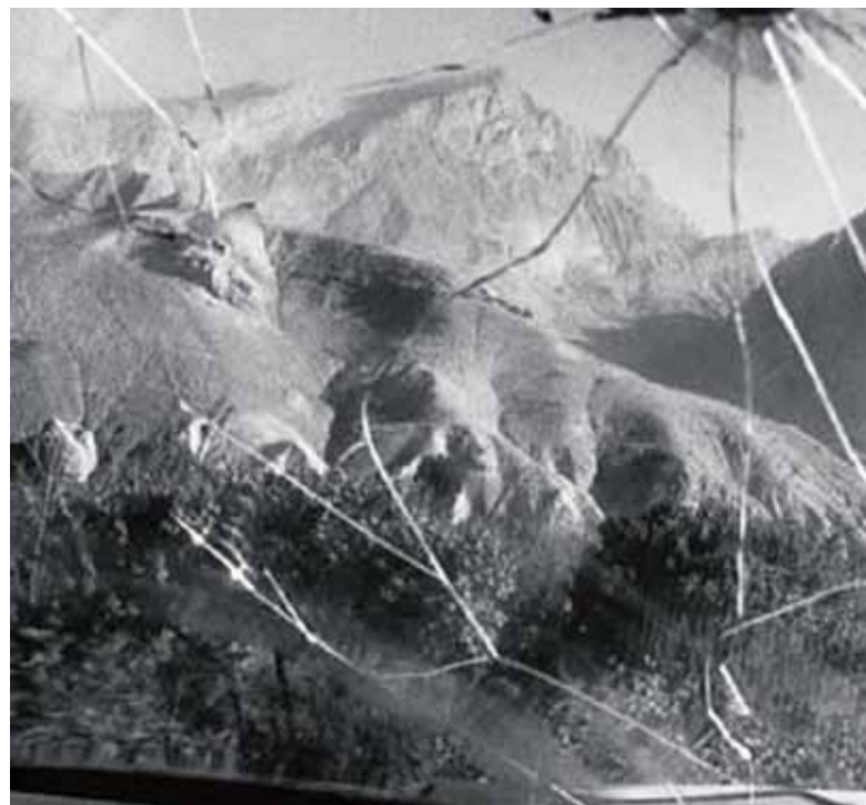
Afghanistan: On the road between Mazar-i-Sharif and Kabul.. Afghanistan has one of the highest concentrations of guns per person in the world. It is believed that

During the last scope debate at the ATT Prep Com in July 2010, many references were made to both civilian and state usage of small arms and their ammunition, and whether it all should be included in the ATT scope. Even though military equipment is the main focus of the ATT talks, or infantry weapons in terms of the SALW debate, states also chose to center aspects of the scope