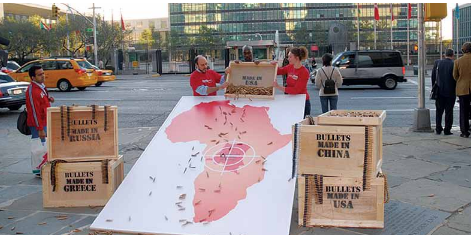
Campaigners outside the UN illustrate that bullets manufactured in Greece, China, Russia and the USA have been found in the hands of rebel groups in the Ituri District of eastern Democratic Republic of Congo (DRC), which is under a UN arms embargo.

encompass, objections against including ammunition must be based on reservations against including ammunition as such in a multilateral regulatory framework, a position which is difficult to accept given such precedence as those instruments mentioned above.