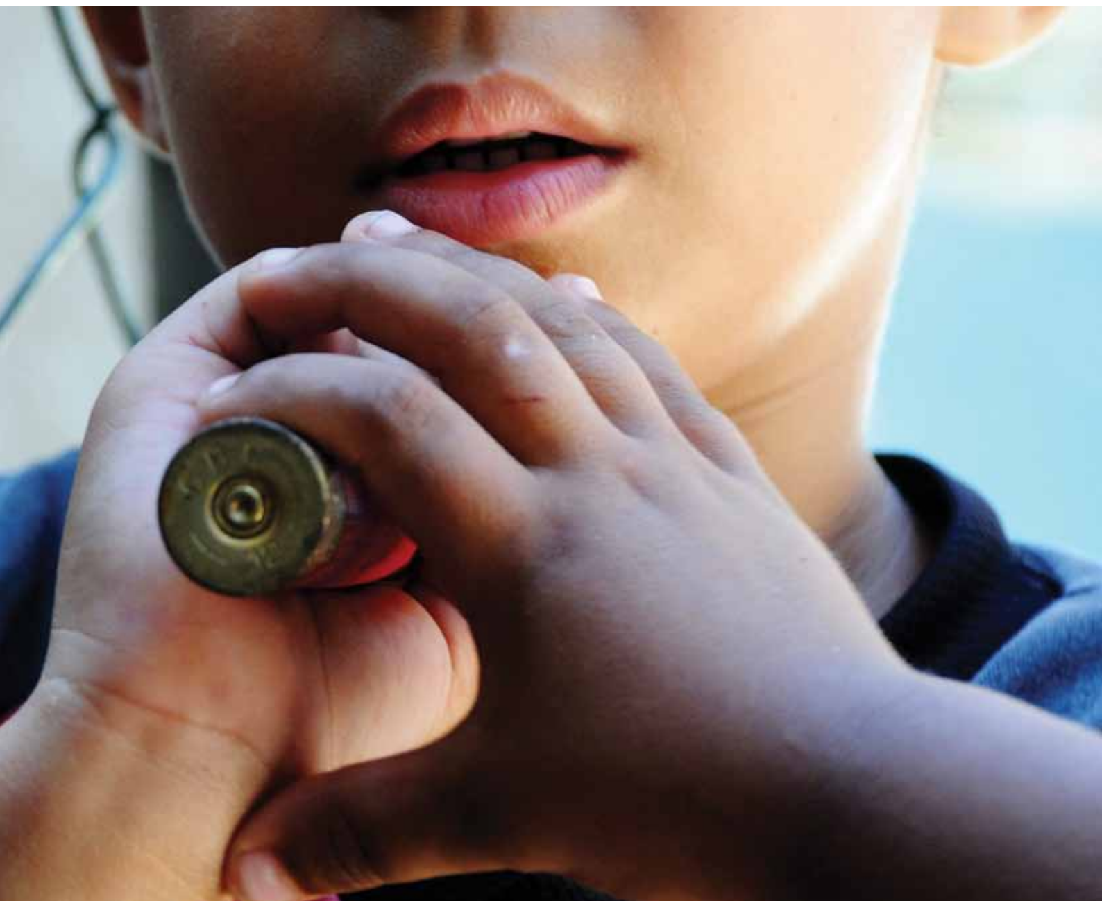
A boy holds a cartridge from the Brazilian ammunitions producer CBC. Almost half of the weapons in circulation in Brazil are illegal, according to a 2010 report by the NGO Viva Rio and the Subcommittee on Arms of the National Congress.