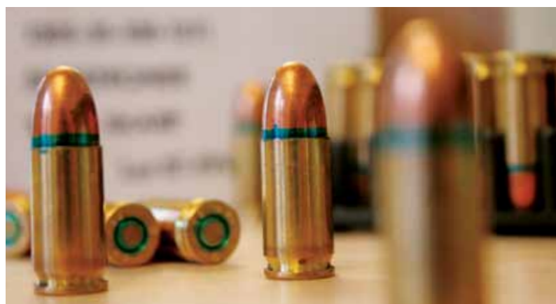
Ammunition and explosives form an integral part of small arms and light weapons used in conflicts.

Defining small arms ammunition, we also need a calibre limit in the upper end to the category. It is universally accepted that small arms ammunition starts from the smallest cartridge based powder propelled ammunition there is, and we therefore need no such limit the other way around. The 1997 GGE is often understood as limiting the small arms ammunition category to any ammunition below 12,7 mm. 27 This upper limit was set to 20 mm by the 1999 GGE 28 , which makes much more sense in the ATT context. The main reason for this is that there are many weapons in use today that shares the characteristics of a small arm listed in GGE 1997, that has a calibre of between 12,7 mm and 20 mm. The technical developments in the field of small arms over the last decade also suggests that the use of such large calibre rifles, designed for use of the individual soldier, will continue to increase in popularity. According to most authorities on the matter, a 20 mm upper limit is therefore more up-to-date and practical. 29 When referring to small arms ammunition, we therefore strongly advise to include all powder propelled cartridge based ammunition of 20 mm calibre or less. Counter-intuitive for many observers, hand grenades 30 certain explosives 31 and mines 32 are also understood as light weapons ammunition in UN terminology. This is why we also need