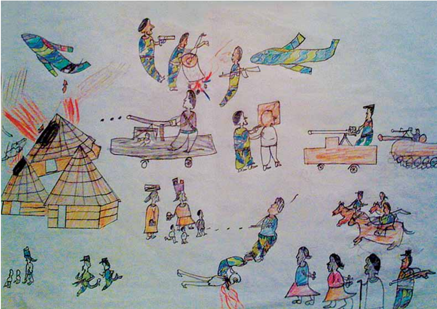
Drawing fire: Childrens drawings from Darfur.

with a better understanding of the role of ammunition in the Arms Trade Treaty process. This paper attempts to address the momentums and possibilities of including small arms ammunition in the scope of an ATT. We hope this will aid the discussions on scope and on the specificities of small arms in the ATT context. It is first of all crucially important to ensure that discussions related to ammunition are firmly based on detailed, comprehensive definitions. In the first chapter, we will therefore offer a typology of all ammunition, discussing the specifics of small calibre ammunition definitions within the UN terminology. In the second chapter, we