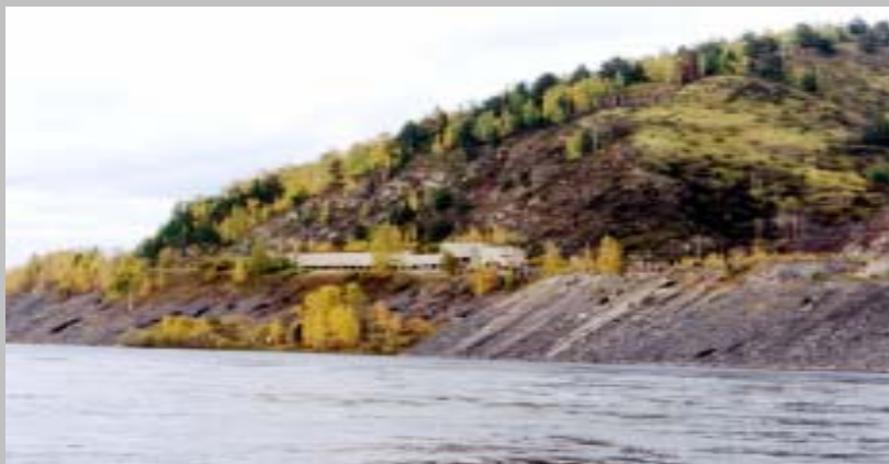
ADE-2 Reactor Site - ZPPEP