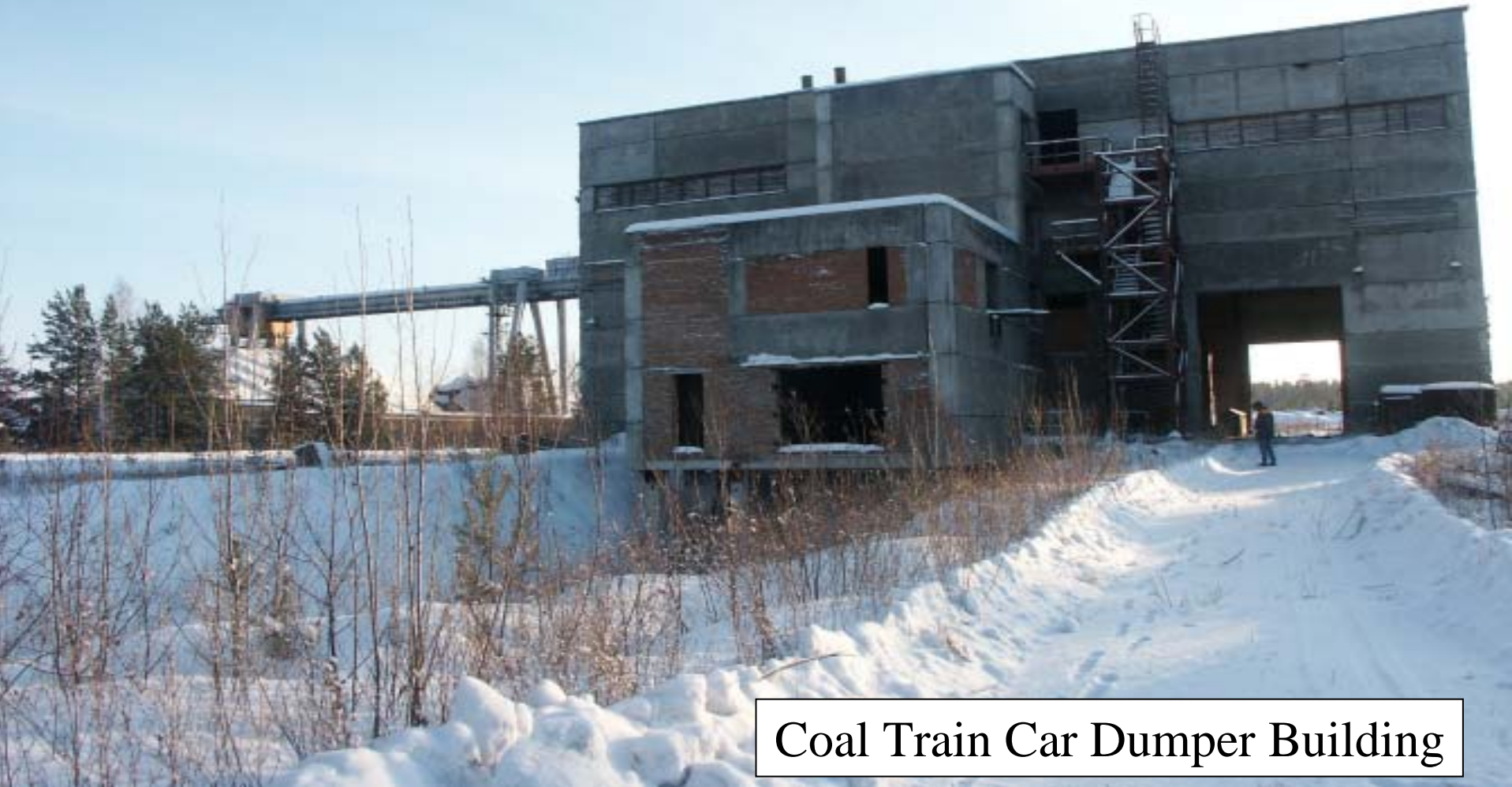
Coal Train Car Dumper Building