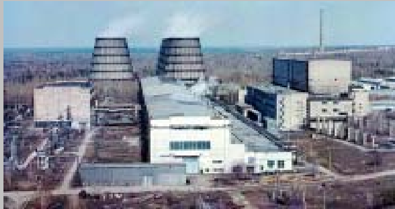
ADE-3 & ADE-4 At Seversk Site