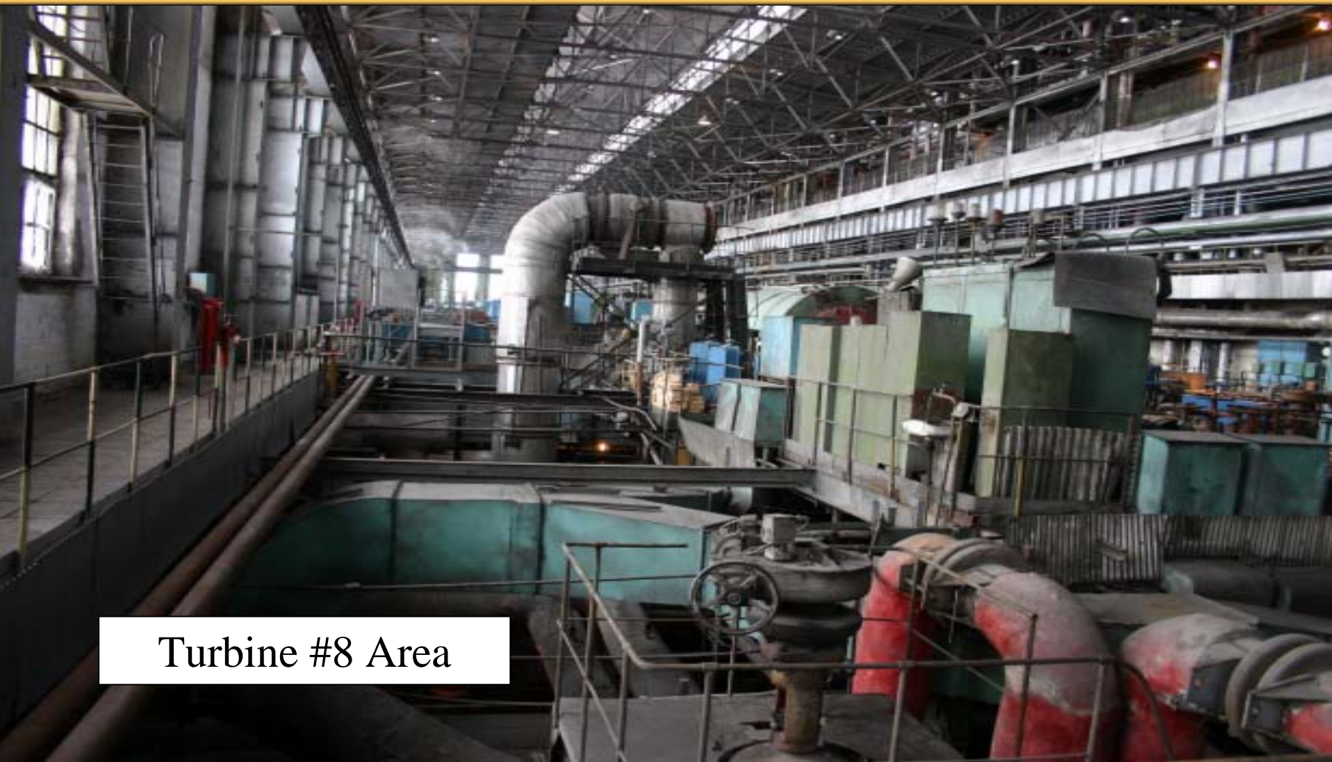
Turbine #8 Area