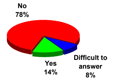
Should Russia transfer its nuclear technologies and weapons to other states?

The men were more enthusiastic about transferring nuclear arms and technologies - 17%, compared with 11% of the women. The share of those opposing such transfer is nearly the same (77% and 80% respectively), while more women were indecisive on the matter (10%, against 6% of men).