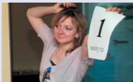
Minute of fame at PIR Center Summer School

PIR Center has been involved in various education projects for some 15 years now; about 700 students, young scientists,