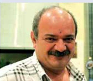
Azer Mursaliyev, Editor-in-Chief of the Kommersant Publishing House