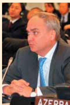
Anatoly Antonov at the White Paper presentation, New York