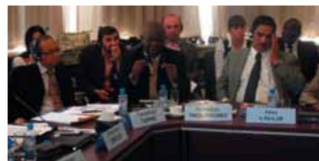
International seminar, June 23, 2011

On September 30, 2011, PIR Center held an enlarged meeting of its Advisory Board on the topic "Fifteen Years of CTBT: Assessing the Achievements and Prospects" . The main report was delivered by the Executive