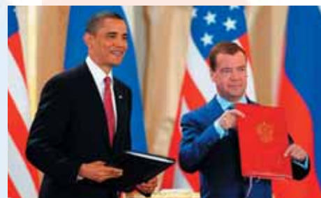
Signing the New START Treaty

On June 25, 2010 PIR Center, in partnership with the Ploughshares Fund, held the international conference “ New START Signed, What's Next? ” The event was attended by more than 100 participants from 18 countries. A greeting message to the participants was sent by Sergei Prikhodko , Aide to the President of the Russian Federation and member of the Security Index journal's Editorial Board.