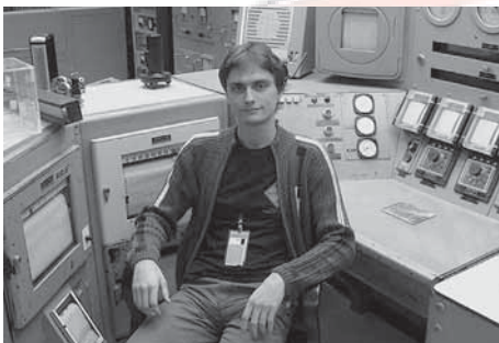
At the control station of Reactor B

In the autumn of 2010, while on a trip to the Pacific Northwest National Laboratory (one of the US Department of Energy's