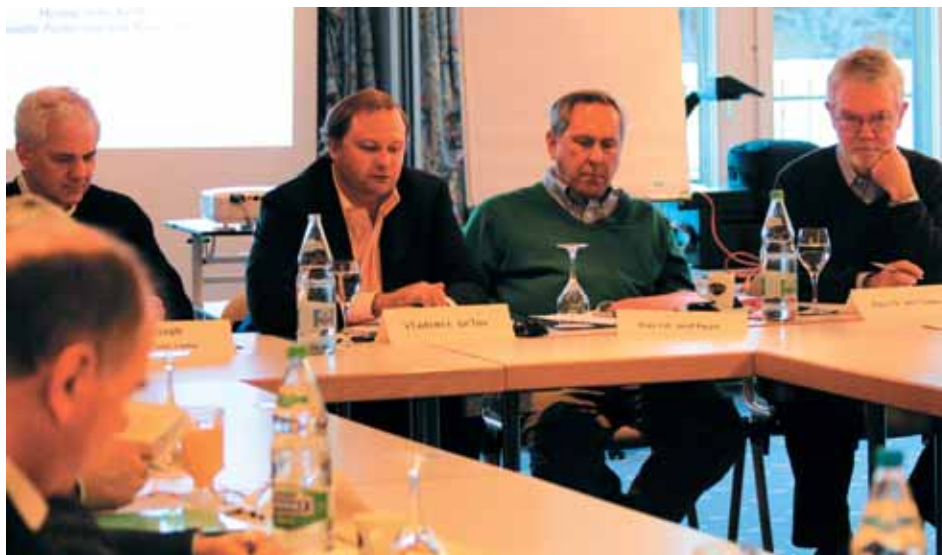
SuPR meeting in Gstaad, February 2, 2011