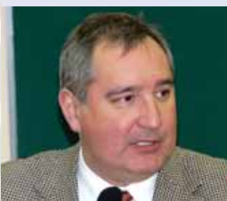
Dmitry Rogozin, Deputy Prime Minister of the Russian Government