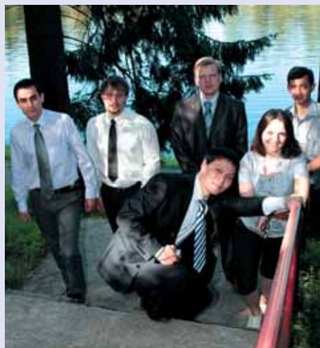
Participants of the International Summer School 2010

The International Summer School on Global Security is PIR Center's key education project and a unique platform for professional growth, open dialogue and promotion of nonproliferation culture. At the Summer School young talents try to find their calling in the area of politics and security; rookie diplomats and researchers meet the best experts and colleagues from around the world, and take part in lectures, seminars, debates and role playing games. The school helps to bring up a new generation of global security specialists, and welcomes new entrants to the international community of young professionals.