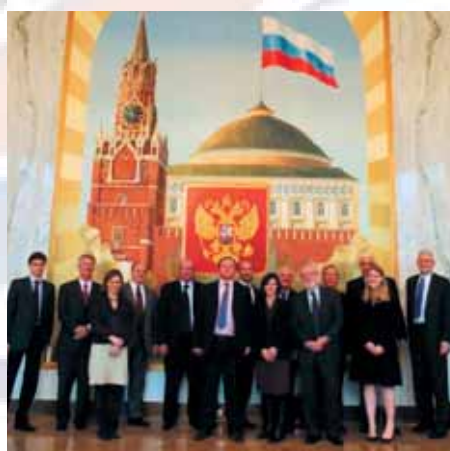
Participants of SuPR meeting in Washington, December 7, 2011

Assistant Secretary of State for Arms Control, Verification, and Compliance Rose Gottemoeller , Special Assistant to the President and White House Coordinator for Arms Control and Weapons of Mass Destruction, Proliferation and Terrorism Gary Samore and Ambassador Extraordinary and Plenipotentiary of the Russian Federation to the USA Sergey Kislyak were among the keynote speakers of the meeting. SuPR members also held a briefing with top US experts on international security issues and bilateral relations.