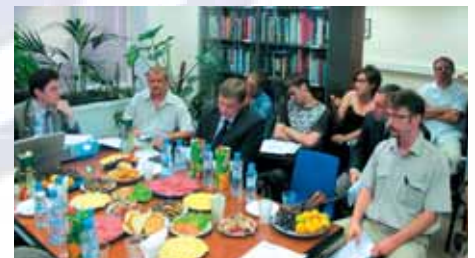
Midweek Brainstorming Session seminar on cyber security at PIR Center

Could social networking services represent a national security threat? What could be the consequences of attempts by some governments to use social networking services for their own military and political ends? The article by Oleg Demidov has been published in the № 1, Winter 2012 issue of the Security Index journal.