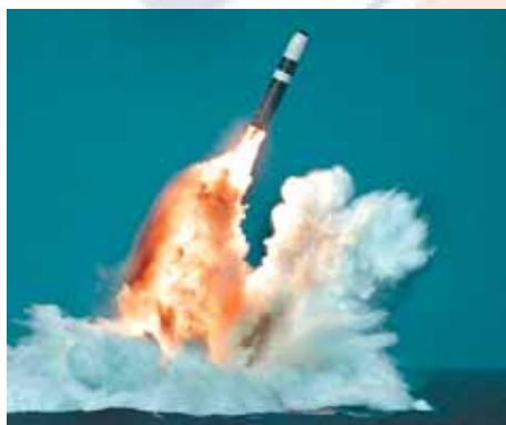
Underwater launch of a US Trident II ballistic missile

All research on the nuclear weapons programs faces the problem of scarcity of information; most of that information is classified or at least not widely available. At the same time, this information is in great demand among the scholars who study international security. The Nuclear Five project prepared by PIR Center within the bigger Ways towards Nuclear Disarmament Project and available at our website at www.nuclearfive.pircenter.org can help solve the paradox. Information about nuclear policies, nuclear forces, the command-and-control system, and the history of the mili-