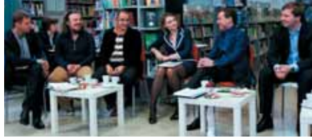
Russian President Dmitry Medvedev meeting with representatives of the internet community