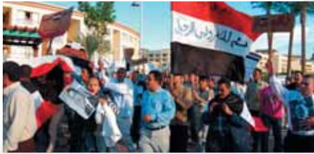
The Arab Spring in the Middle East, 2011

The cyber attack against the Iranian nuclear infrastructure facilities using the Stuxnet virus was one of the key international security developments in 2010. The Arab Spring of 2011 has given rise to a debate in the international expert community about social networking sites as an extremely powerful information weapon, which can potentially destabilize entire regions in the blink of an eye.