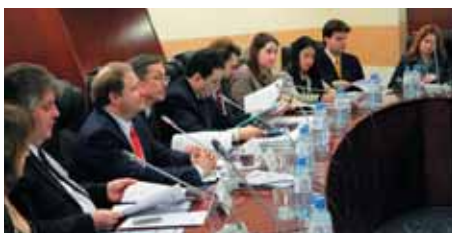
PIR Center's Advisory Board meeting, March 23, 2011

tary programs and nuclear tests was gathered from open sources and is presented for all five official nuclear-weapon states in Russian.