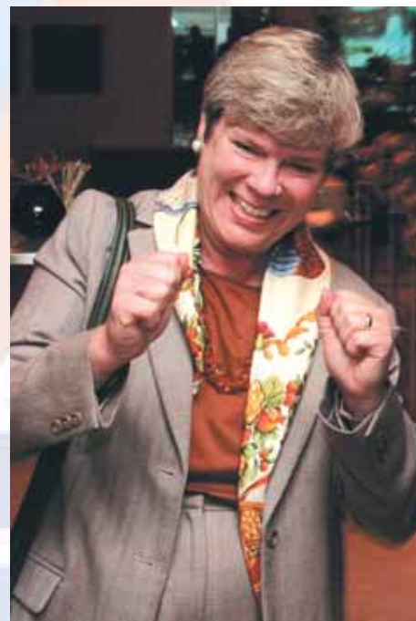
Acting Under Secretary of State for Arms Control and International Security Rose Gottemoeller, PIR Center Advisory Board member