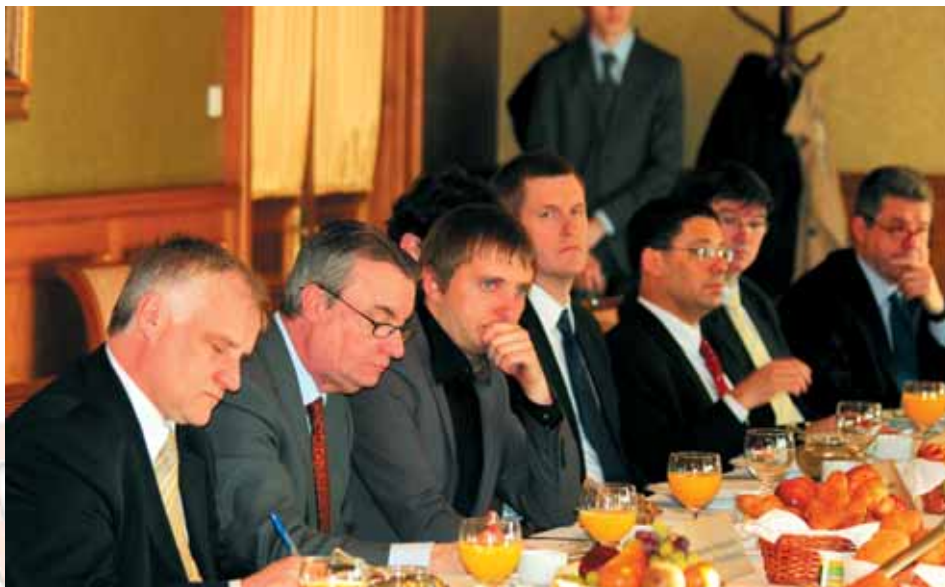
Meeting of the Trialogue Club International, March 30, 2011

Triologue Club International offers to its members a unique opportunity to communicate informally with the people responsible for decision making, and to get access to the most recent, sometimes even insider, first-hand information. If one wants to learn what the Russian Deputy Minister of Foreign Affairs really thinks on the Iranian nuclear program, or what the Chief of the General Staff makes of various peacekeeping operations, Trialogue is one of the very few options available.