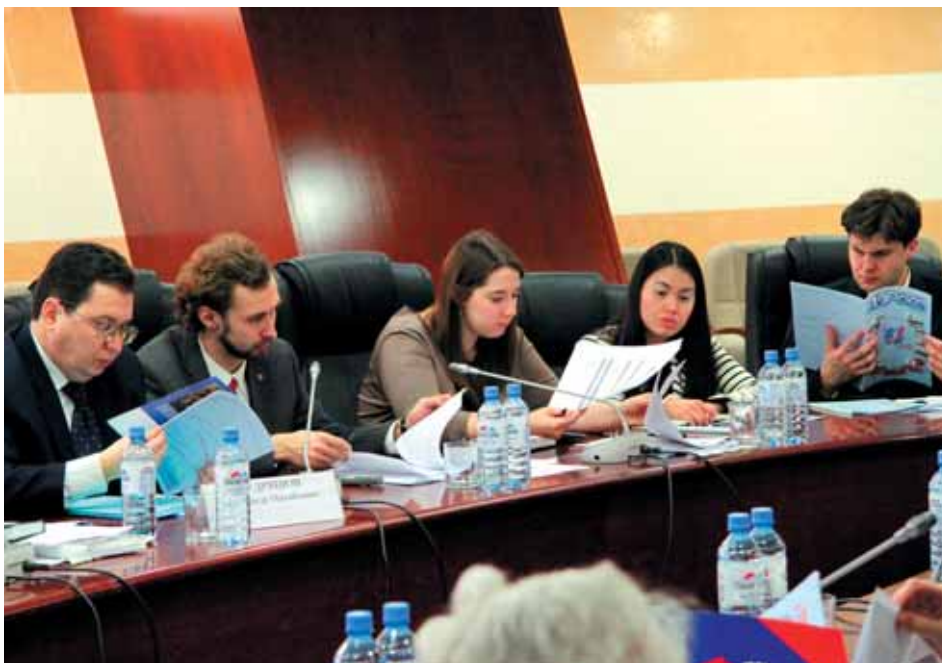
PIR Center extended Advisory Board meeting, March 23, 2011

The PIR Center Advisory Board is a community of friends, partners and colleagues, which allows to expand significantly our area of expertise in case of necessity and to raise the level of discussion through the participation of new specialists.