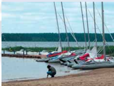
Lake Seliger, Tver Region

Seliger is an international forum attended by thousands of participants from all over the world. The venue, Lake Seliger, offers stunning views of the Russian countryside. For PIR Center lecturers this was the most colorful event of 2010 and 2011.