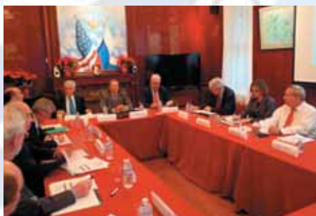
SuPR meeting in Washington, December 6, 2011

Another SuPR meeting was held by PIR Center and Ploughshares Fund on December 6–7, 2011 in Washington, DC. The topic was « Future of the Russian-US Strategic Dialogue: Beyond Deterrence – Building a Sustainable Agenda ». The key issue on the agenda of the meeting was the future of US-Russian relations after 2012, the year of presidential elections both in Russia and in the United States.