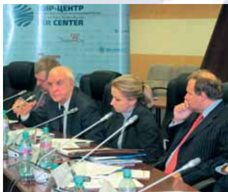
PIR Center Advisory Board meeting, November 24, 2011

On November 24, 2011, the meeting of Advisory Board was held in cooperation