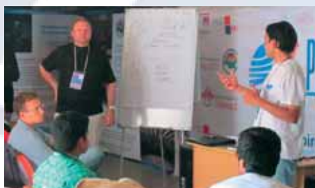
PIR Center experts participating in debates, Seliger 2011