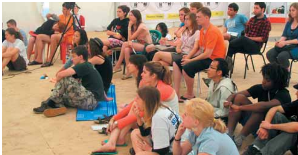
Participants of the Seliger Forum listen to the lecture given by Vladimir Orlov

July 5–6, 2010: Seliger 2010 International Forum