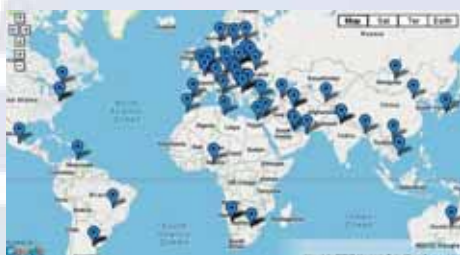
Interactive map of Russia's peaceful nuclear cooperation

In 2010 as a part of the Development of Russia's Nuclear Exports project we gathered all the available data on Russian cooperation with other states in the sphere of nuclear power engineering. As a result, we are proud to present an interactive map that reflects peaceful nuclear cooperation between Russia and foreign countries and a unique selection of intergovernmental agreements that regulate this cooperation. The project has already proved a valuable source for any research in the sphere, which had hitherto notoriously lacked trustworthy information. The data is available at the PIR Center website: www.atom.pircenter.org/eng